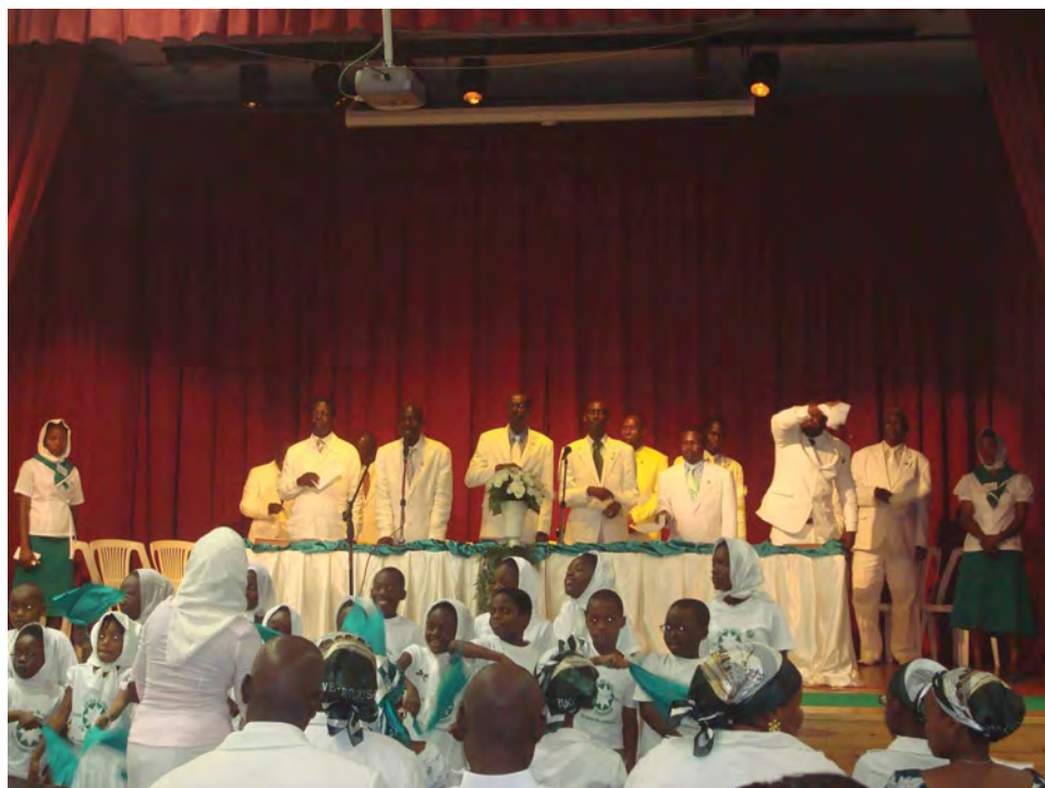
Figure 2. Celebrating the events of 1949 in Lisbon, July 2008.