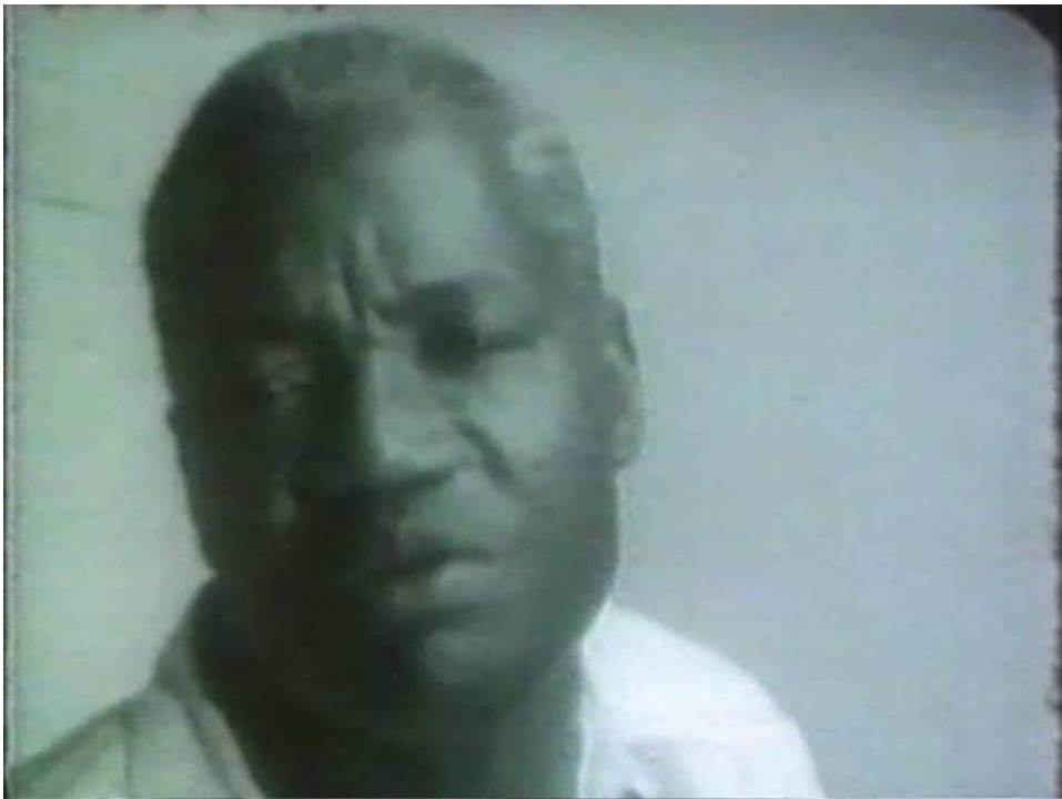
Figure 1. Simão Toko interviewed by Portuguese Television; date unknown.

This internal production of memory is counterbalanced with the abundant external sources available on the Tokoist movement. Perhaps the most impressive of those sources are the records from the PIDE (Portuguese political police, active during the