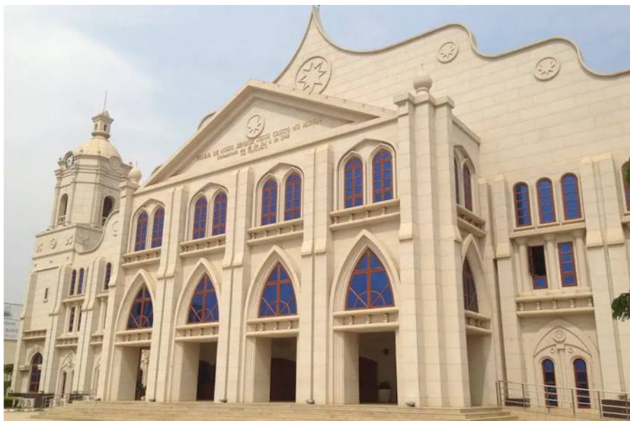
Tocoist Cathedral - Social Administrative Headquarters

The headquarters of COLJCW is located in the Republic of Angola. The Social Administrative headquarters is situated in the city of Luanda and the Spiritual headquarters is in Sadi Zulumongo – Ntaia Maquela do Zombo, Uíge Province.