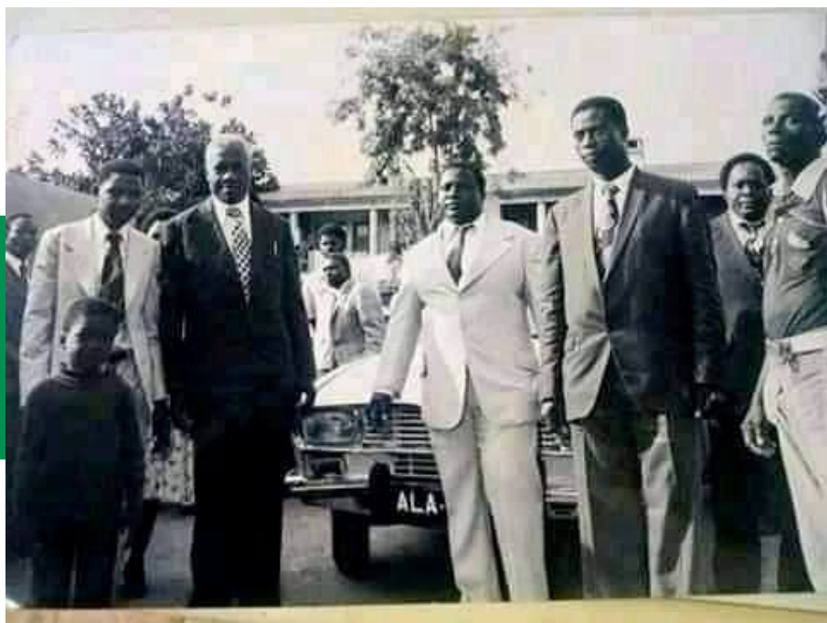
His Holiness on a Pastoral Visit

The Portuguese State only legally recognized the Church of Our Lord Jesus Christ in the World (The Tocoists) in 1974 during the period of political transition to the Independence of Angola, with Admiral Rosa Coutinho as the High Commissioner.