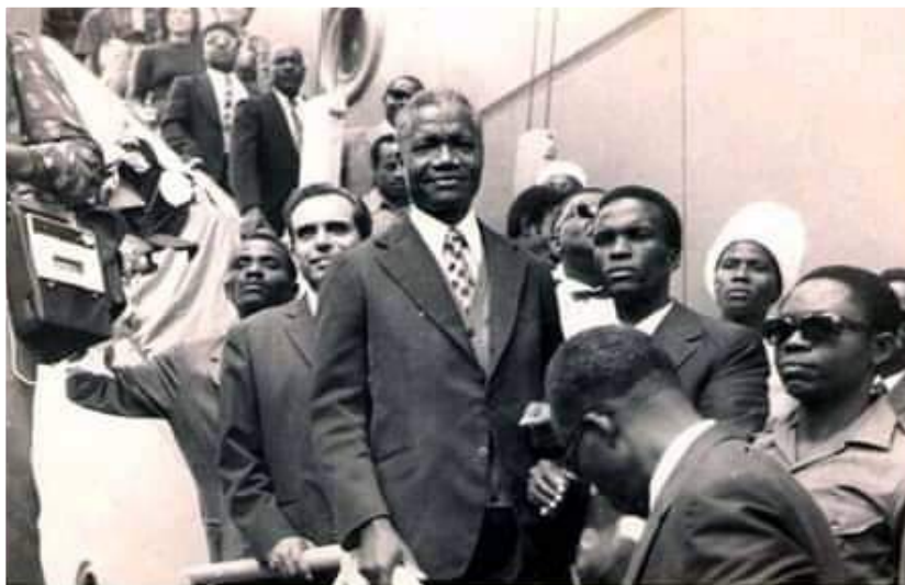
Returning from exile (Azores - Portugal)

He returned from exile (Azores - Portugal) on August 31, 1974, where he had been for more than 11 years. During this period, he led his Church through thousands of Epistles that he regularly sent to Angola and other parts of the world under censorship by the Portuguese colonial authorities.