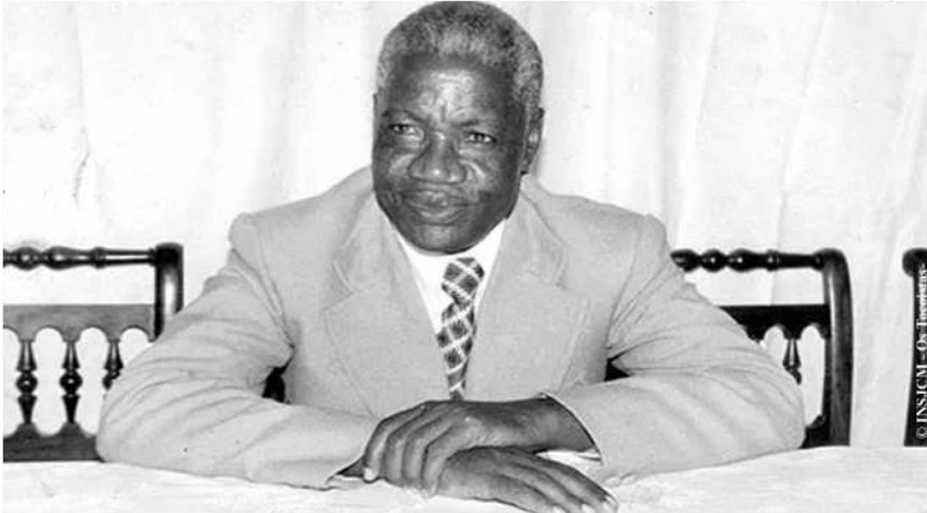
Prophet Simão Gonçalves Tôco

His Holiness Prophet Simão Gonçalves Tôco, the Eternal Leader of the Tocoists, was born on February 24, 1918, in the village of Mbanza Zulumongo, located in Northern Angola, near the border with the Democratic Republic of the Congo (DRC).