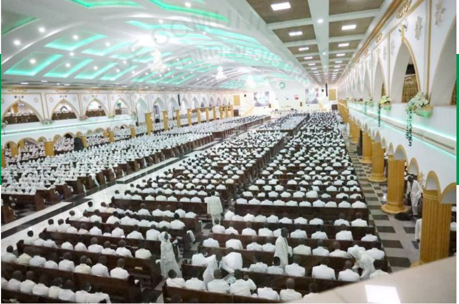
Inside the Cathedral during Worship Service

The Sunday worship service, held weekly, is the primary form of collective worship to God, bringing together the faithful of the local Christian congregation in a single session, typically lasting around 2 hours and 30 minutes. It is usually led by the local highest clerical authority.